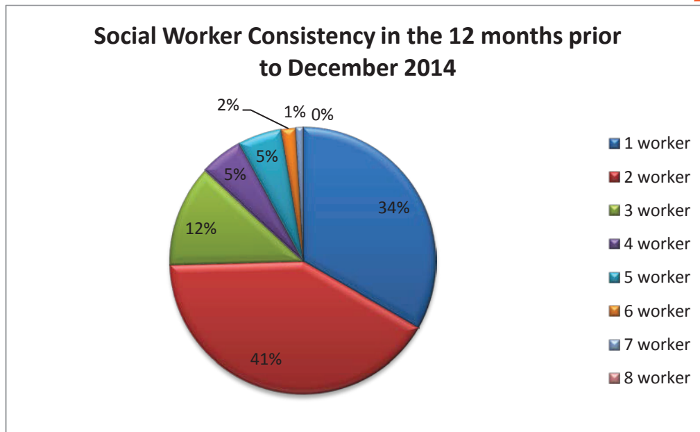
Pie Chart 1

This approach also strengthens the consistency of relationships of our social workers and our Looked After Children. We recognize that in order for good bonding relationships to be formed between our LAC and social workers, consistency and stability is important. The below shows our progress in this.